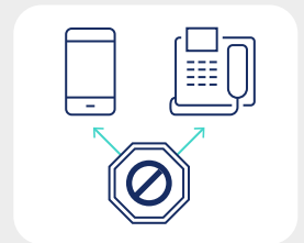
Block Fraudulent Calls

L' ] >L; j] [ ] an \, & 'e ad'f jgZg[Ydl[ge h'd'af'k'af' *(*) $ nh'jge', & 'e ad'f l' ]' h'aj' q] Yj& gZg[YdlZY\ Y[l'gk] [gflaf' n' ] lg'Y\brkl'l' ] a'kljYl]_q'lg' dh\ \] I] [l'af&L' ]' l'ae ] 'ak'fgo'lg' a' h'jgn] 'qgn] knZk[jaZ] jkO[Ydl] ph] j] a f [ ] &